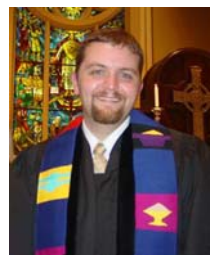
Front page written by: Jake Caldwell, Resident Minister

The Chimes (USPS-097-160), is published Bi-weekly by Central Christian Church Periodicals postage paid at Lexington, KY 40511. Postmaster: Send address changes to: The Chimes, Central Christian Church, PO Box 1459, Lexington, KY 40588